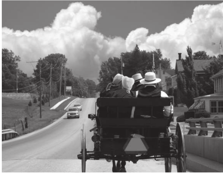
Image of the Amish travelling in a courting buggy on a road in Pennsylvania

The Amish are a religious community in Pennsylvania, USA. Their strict religious beliefs mean they reject some features of modern lifestyles, like the motor car. Individuals who do not conform to the norms of the group can face ostracism by their community. The Amish have become a tourist attraction because their way of life is so different. There can be conflict between them and the tourists as their religion means they are not happy to be photographed.